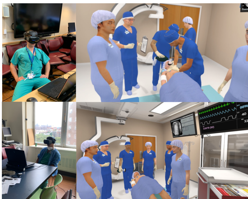
Figure 2. Virtual reality participants and refresher course screen shots.

The VR intervention was an educational module designed by Health Scholars (Denver, CO) that tested participants on the same AHA algorithms as mentioned above. Sessions were run on Dell and HP laptops and Samsung and HP VR headsets using Windows (Microsoft, Redmond, WA) Mixed Reality Software. The session placed the participant in the role of team leader to take care of a critical patient in a radiology suite. The VR intervention utilized voice controls, with a virtual team to which the participant could delegate tasks (Figure 2). Participants were graded on the same rubric as above, including Correct , Correct with Assistance , and Incorrect . All of the same scenarios and algorithms were tested as in the HFS group. When the module concluded and the participant removed the headset, the session was completed. As with the high-fidelity arm, only vocal skills were tested, and only the team leader role was examined. Participants were expected to delegate all manual tasks to other team members, including compressions, airway management, and defibrillation. The participants did not interact with the proctor unless there was an issue with the functionality of the system. Participants were given as much time as needed to complete the module. Independent proctors were given transcripts of the VR sessions in the form of log files to determine if incorrect answers were because of a knowledge deficit or because of the voice recognition system misinterpreting the learner.